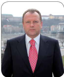
Marius L. VIZER IJF President

After a winter break the IJF World Judo Tour 2015 opens in Dusseldorf, Germany with the first of 11 Grand Prix events.