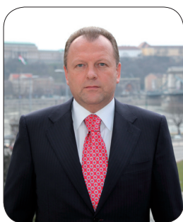
Marius L. VIZER IJF President

Dear participants of the Judo Grand Prix, Zagreb 2015, we look forward to seeing you at the third annual Grand Prix in Croatia.