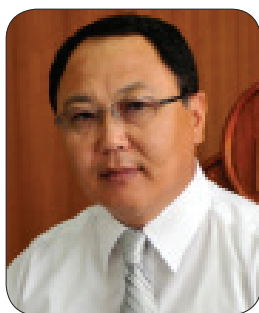
Mr. DORLIGJAV Dambii Minister of Justice and Home Affairs Chairman of Organizing Committee

First of all, I would like to thank all Judo people across the world for your heart and spirit for organizing and participating for 3rd IJF Chinggis Khan Judo Grand Prix in Ulaanbaatar, Mongolia on 3-5 July, 2015.