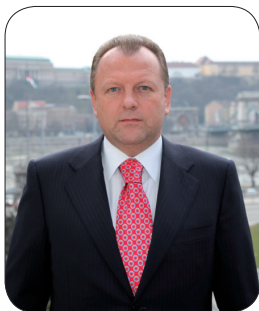
Marius L. VIZER IJF President

The third edition of the Chinggis Khan Grand Prix will take place from 3-5 July and will be one of the biggest sporting events ever to be held in Mongolia.