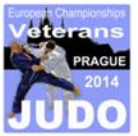
Image of Athletes

The federations are responsible to have obtained the rights for the EJU to use the competitor's image in whichever way it considers it necessary for the promotion of the sport.