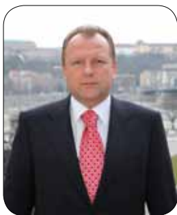
Marius L. VIZER IJF President